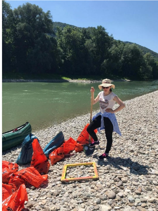
Field work at the Danube

Vienna is a city where new cultures meet each other and as a friendly and communicative person I was able to learn something about other people's traditions, languages and customs.