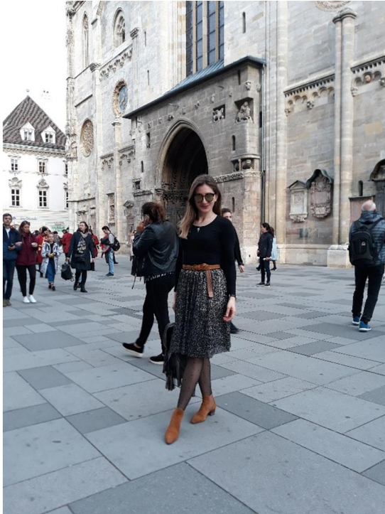
Me in front of the Stephen's Cathedral