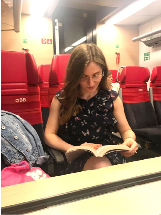
Reading in the train on my way to the airport

Friendly people, culture, education and public transport definitely made a big impression on me. It is amazing how many good habits a person can acquire in five months. One such habit I have acquired in Vienna is waste sorting. I hope that habit will soon be widespread and applicable in my country. A funny situation happened after returning to Sarajevo, in one of our shopping malls, when I was looking for a special bin for the bio-waste disposal.