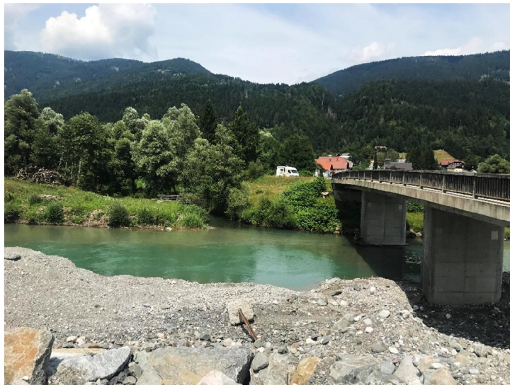
Field work at the Gail River